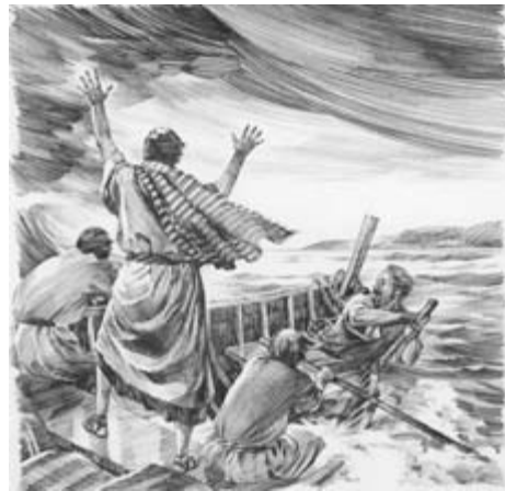
Calming the storm, depicted by Ken Tunell

Our salvation depends on the reality of Jesus’ hu-