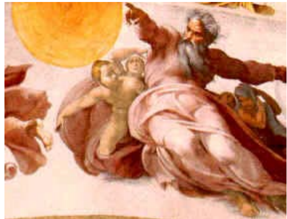
Creation of stars and planets, by Michelangelo

Design. Creation shows signs of order, of laws of physics. If various properties of matter were different, then earth would not exist, or humans could not exist. If the size or orbit of earth were different, then con-