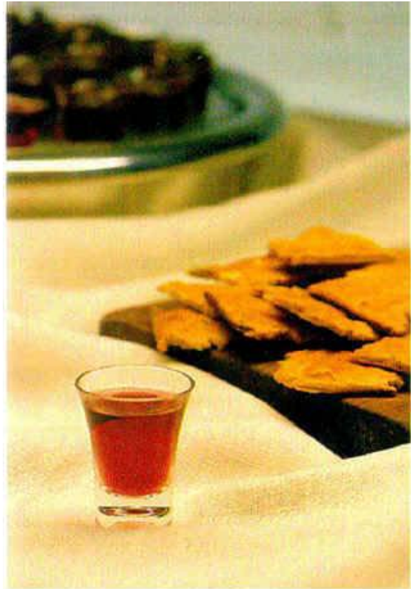
The Lord's Supper commemorates Jesus' death on the cross.

Thirdly, Christ’s salvation must be a free gift. He “purchased” it for us at the high price of his own life-blood. So what is there left for us to pay? Nothing! ( The Cross of Christ , page 83)