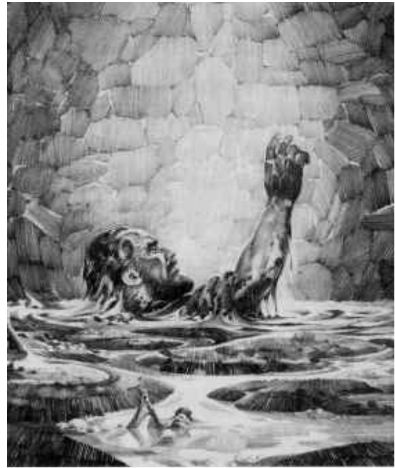
Depiction of Jeremiah after being lowered into a cistern (Jeremiah 38:6).

Peter wrote, “In this you greatly rejoice, though now for a little while you may have had to suffer grief in all kinds of trials” (1 Peter 1:6). Most non-Christians and even some Christians continue to be