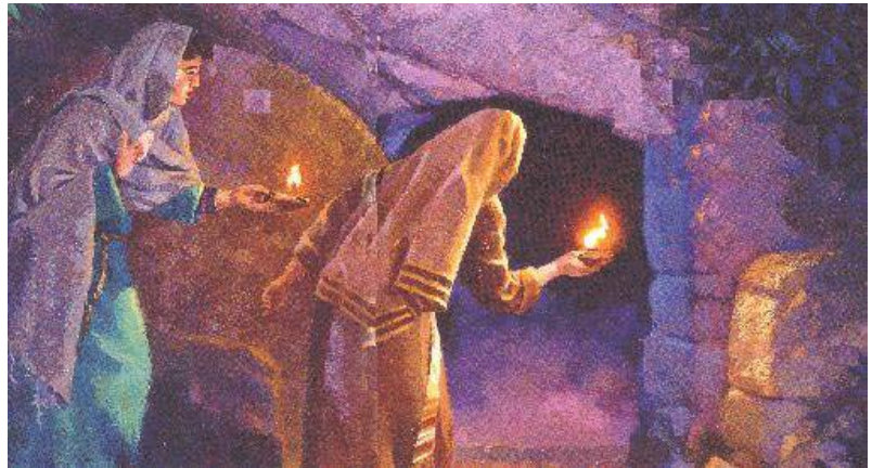
The women discovered that the tomb was empty.

But if Jesus is the sinless Son of God, then he is